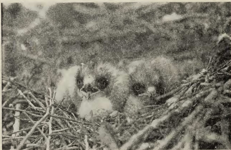
Figure 1. Sennett's White-tailed Hawks, age 14 days. Aransas Refuge, Texas April 25, 1941

No information was obtained on the length of the incubation period. Young are hatched about one day apart. The nestling's eyes are open at hatching. The downy young "is an odd-looking chick, quite different from other young hawks" (Bent, 1937:218). It is covered with a dirty-gray, or brownish, down and has a black mask on the face. Colors of